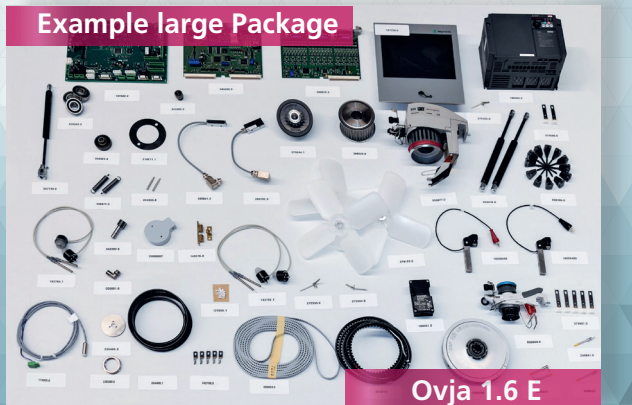
Ovja 1.6 E